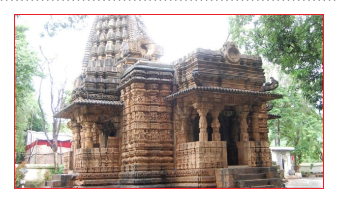
Bhoramdeo Temple, Kawardha